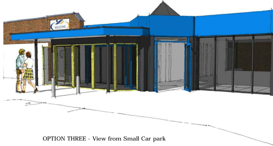
OPTION THREE - View from Small Car park