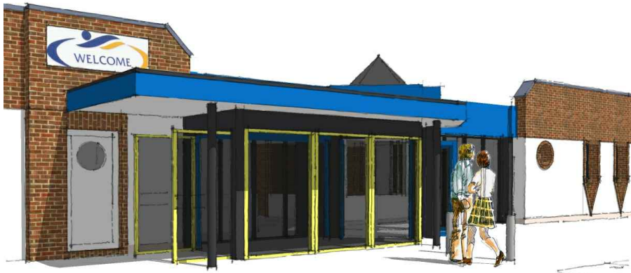
OPTION THREE - View from Main Car park