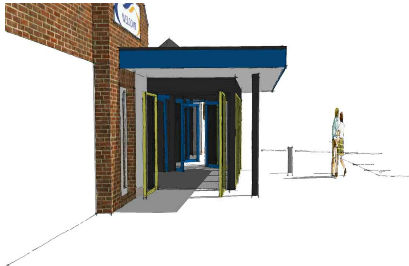
OPTION THREE - Approach from Main Car park